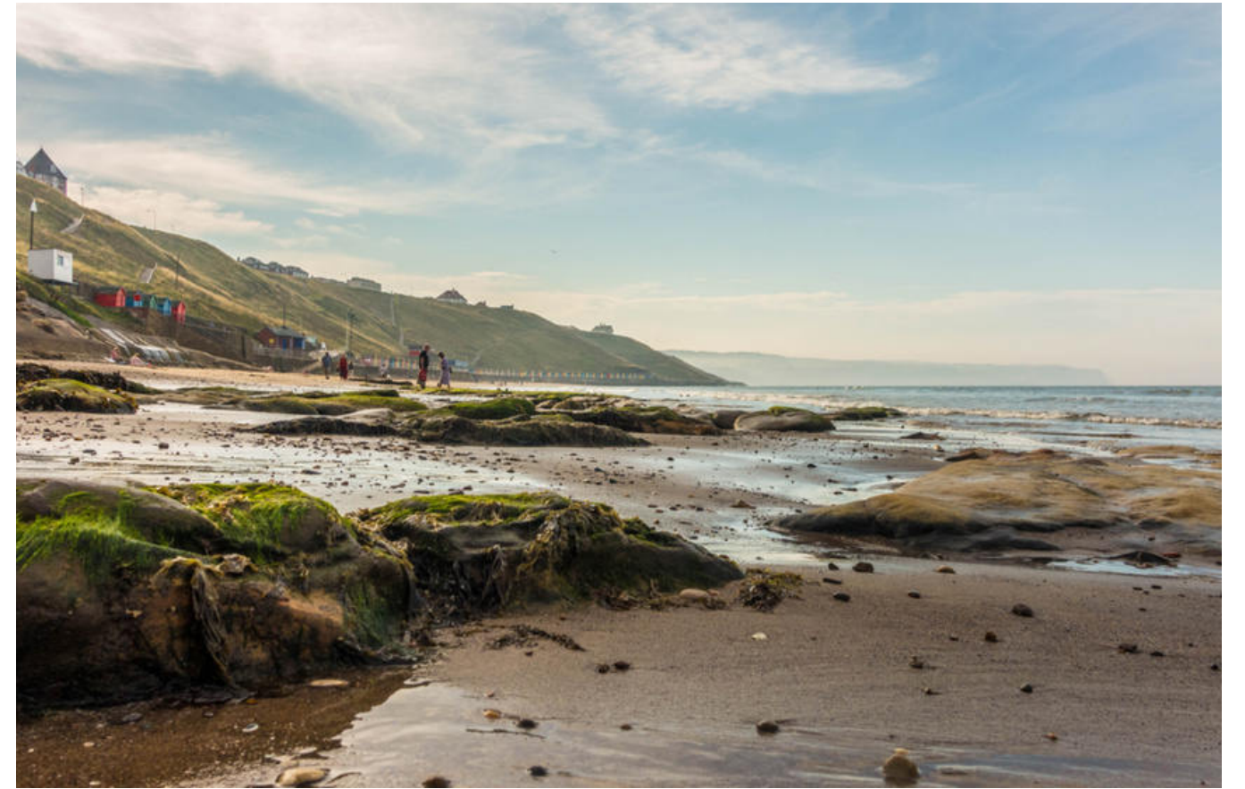
Whitby Beach, North Yorkshire 73 miles from Leeds