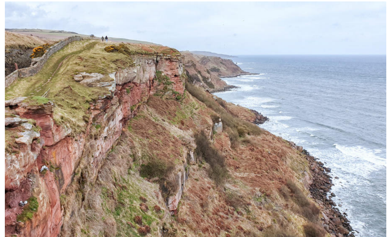
Berwickshire Coastal Path, Northumberland 58 miles from Newcastle