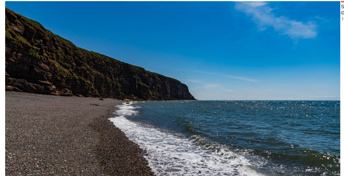
St Bees, Cumbria 101 miles from Newcastle