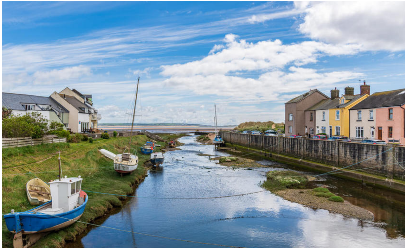
Haverigg, Cumbria 76 miles from Blackpool