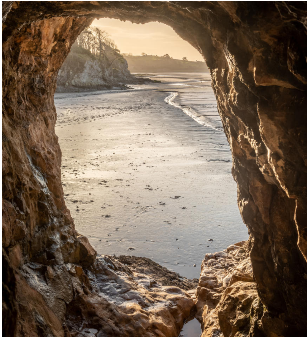
Silverdale Cove, Lancashire 39 miles from Blackpool