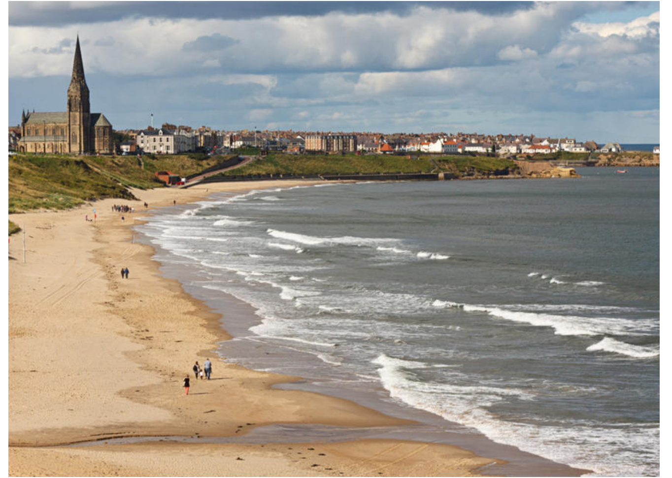
Whitley Bay, Tyne and Wear 10 miles from Newcastle