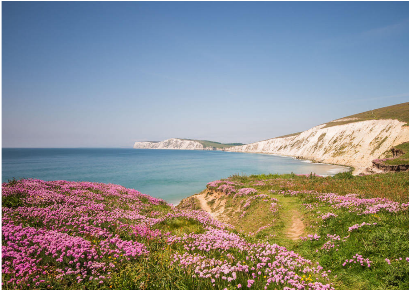
Freshwater Thrift, Isle of Wight 25 miles from Bournemouth