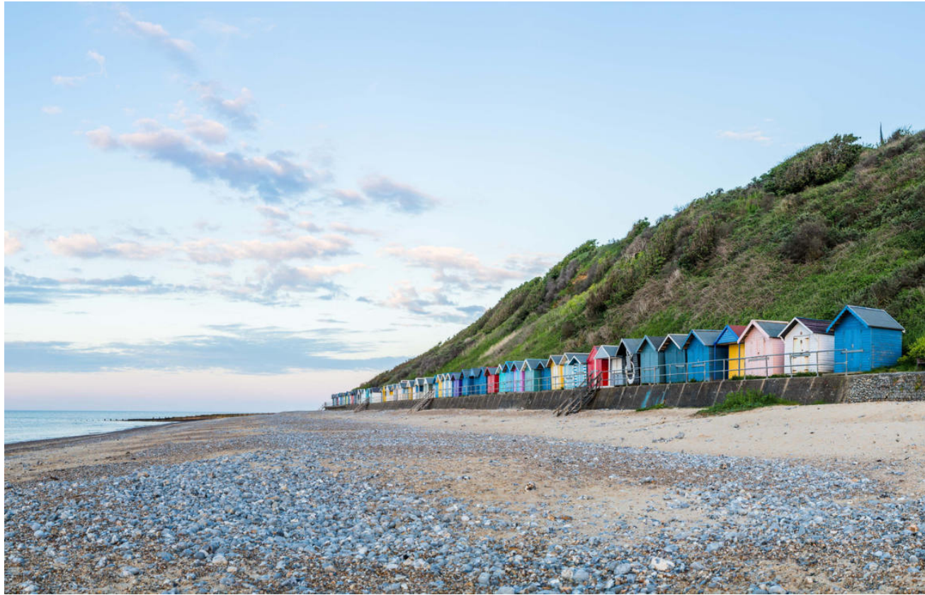
Cromer, Norfolk 46 miles from Norwich