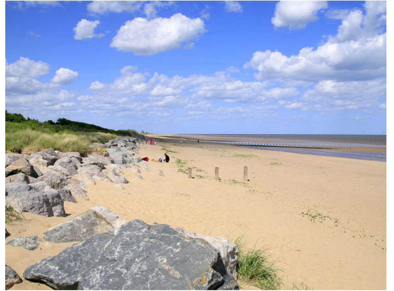
Winthorpe, Lincolnshire 26 miles from Nottingham