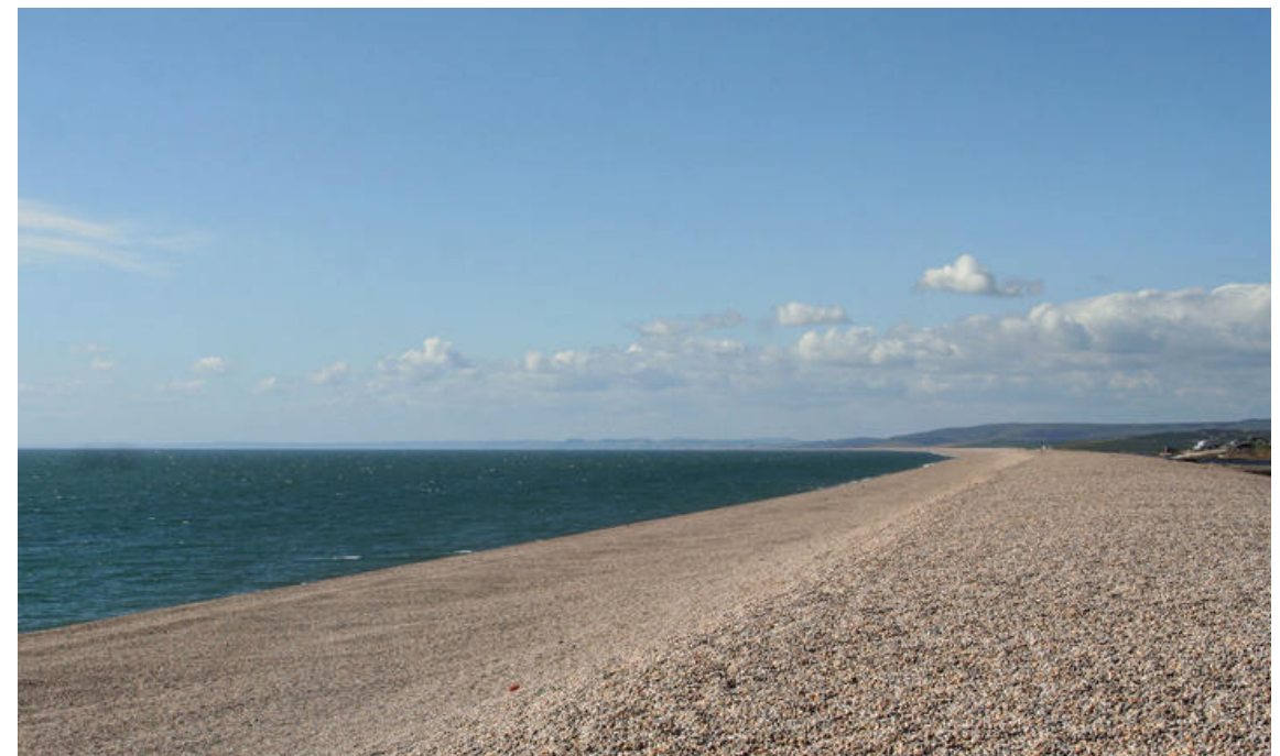
Chesil Beach, Dorset 70 miles from Bristol