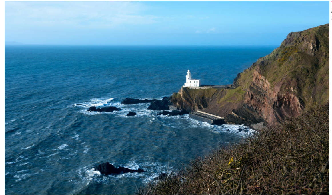
Hartland Point Lighthouse, Devon 54 miles from Plymouth