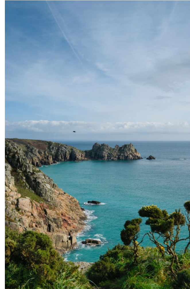
Porthcurno, Cornwall 86 miles from Plymouth