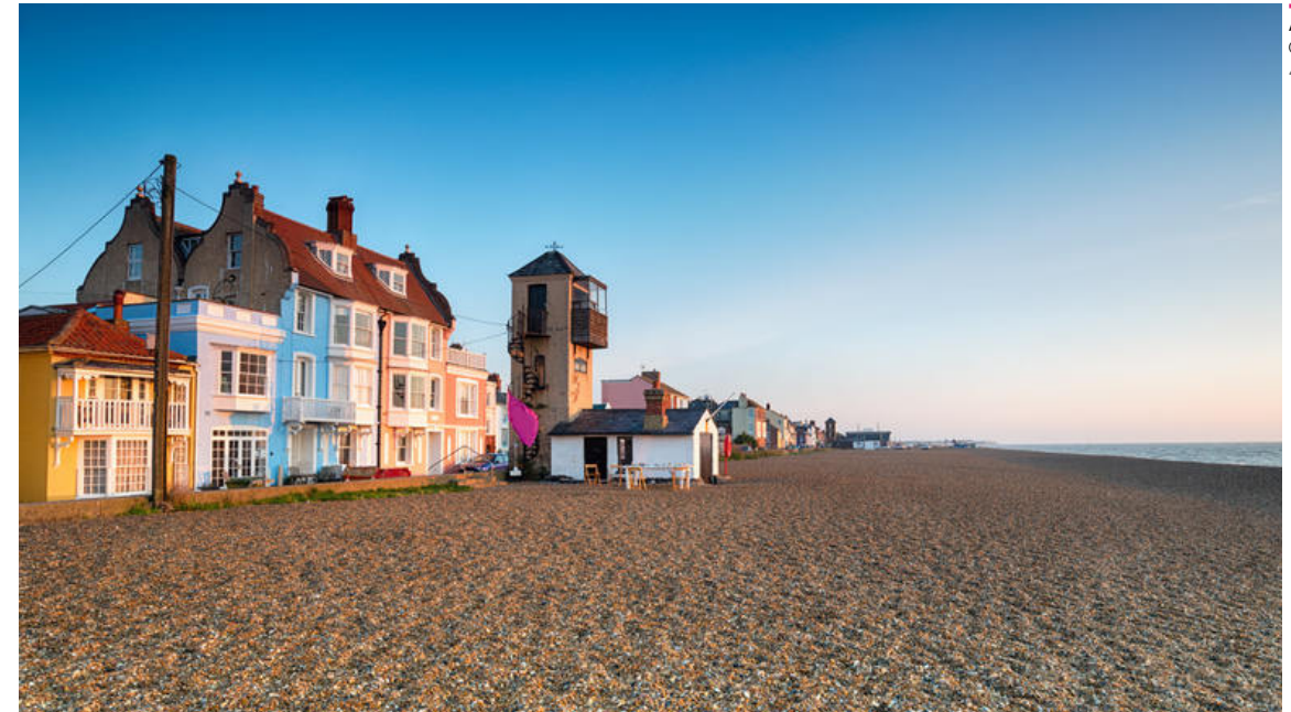
Aldeburgh Beach, Suffolk 43 miles from Norwich