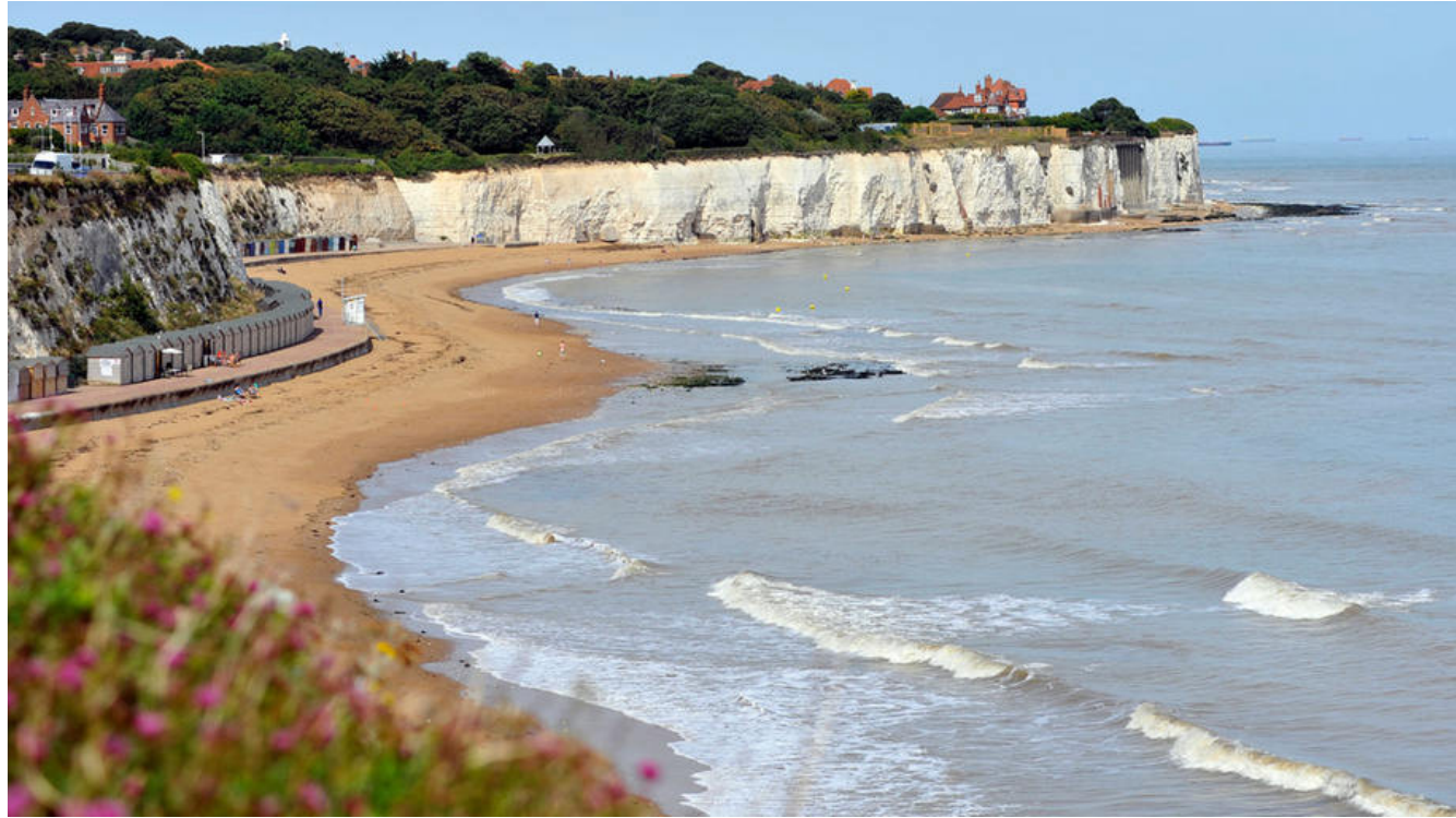
Stone Bay, Kent 81 miles from London