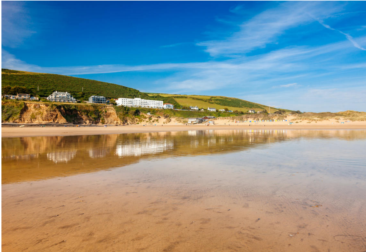
Saunton Sands, Devon 71 miles from Plymouth