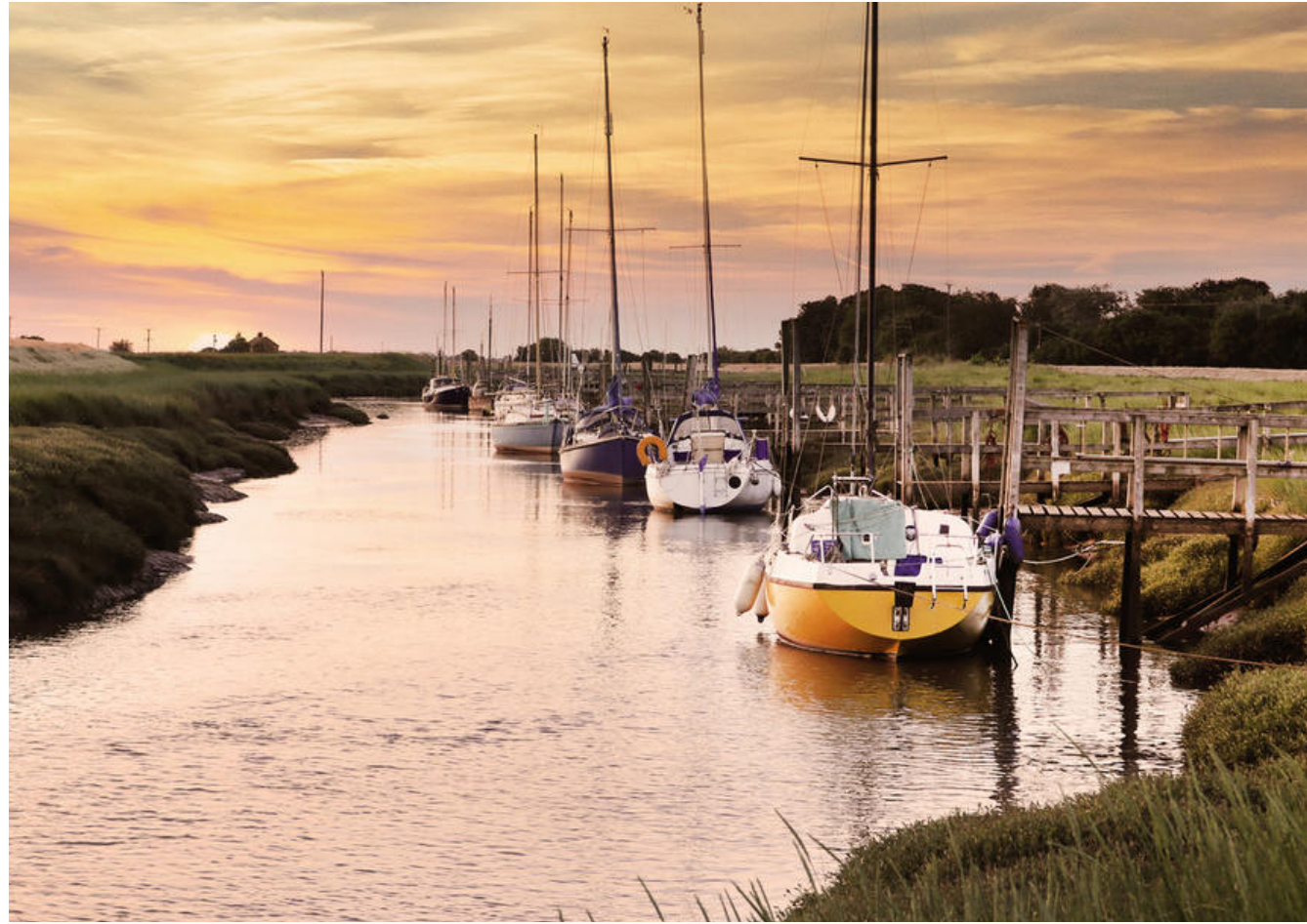
Gibraltar Point, Lincolnshire 79 miles from Nottingham