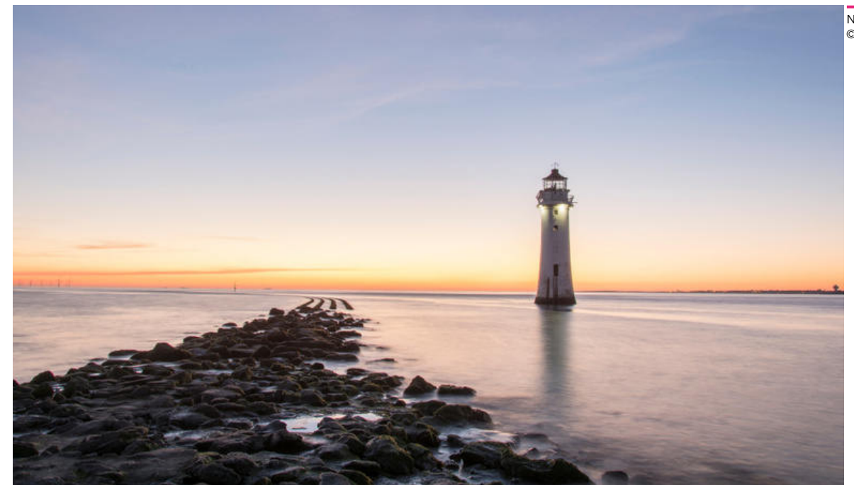
New Brighton, Liverpool