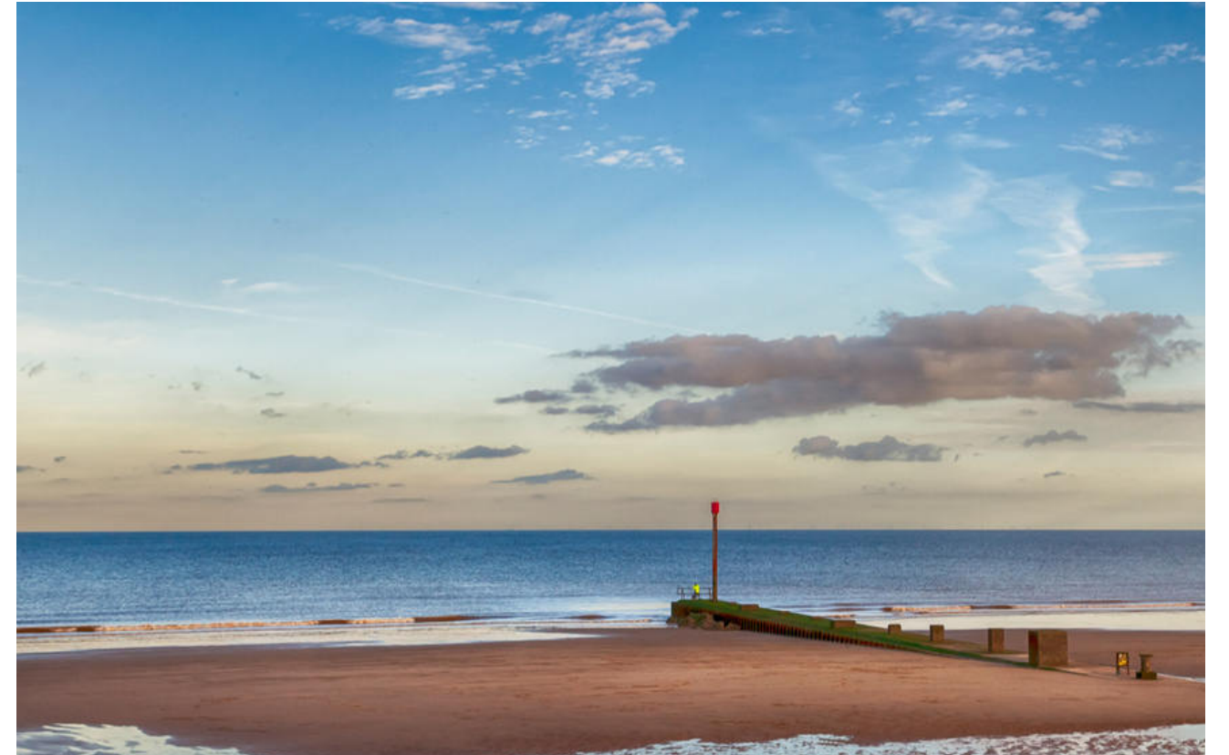
Mablethorpe Beach, Lincolnshire 81 miles from Nottingham