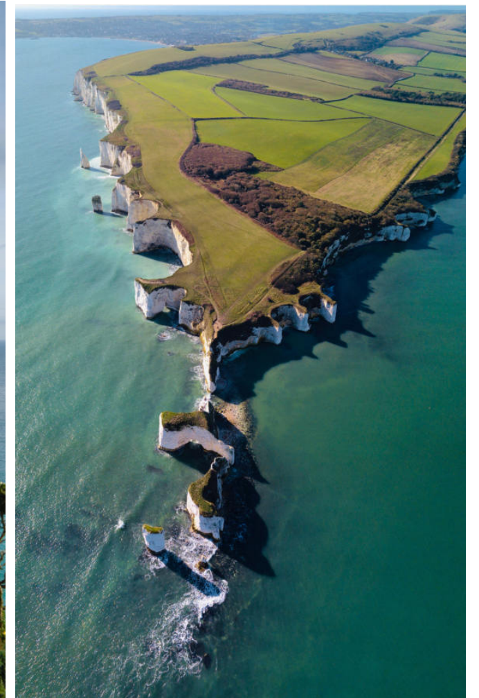
Old Harrys Rocks, Dorset 80 miles from Bristol