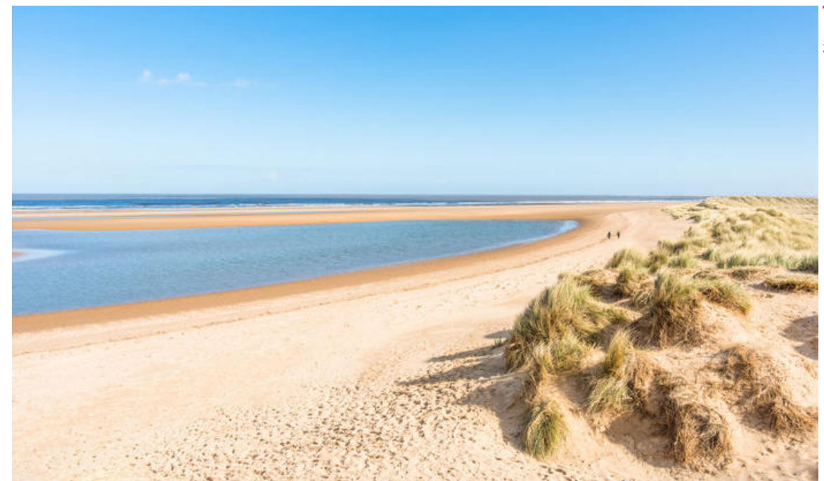
Holkham Beach, Norfolk 38 miles from Norwich