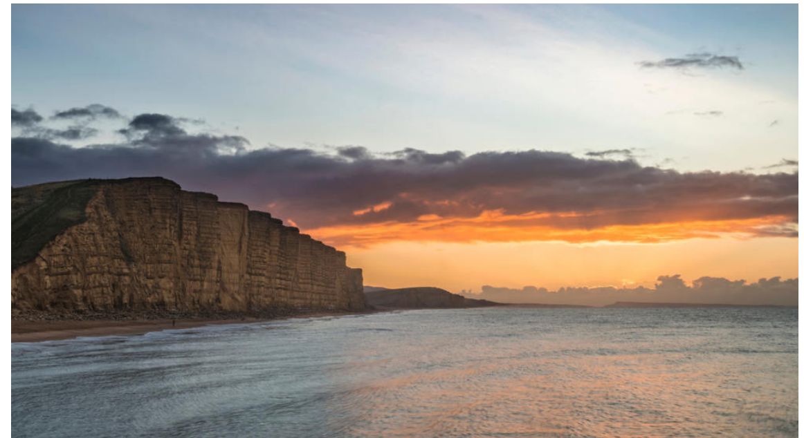
West Bay, Dorset 61 miles from Bristol