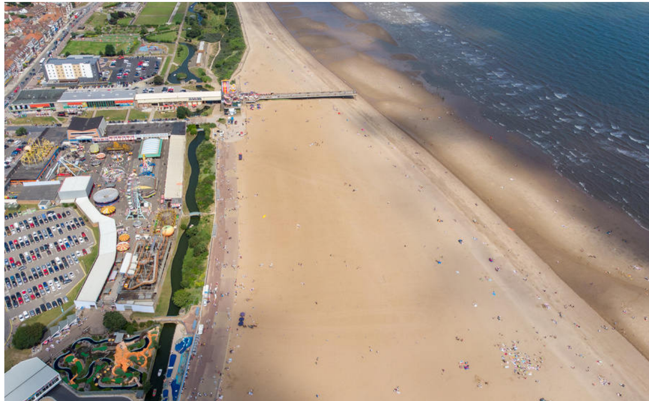
Skegness, Lincolnshire 76 miles from Nottingham