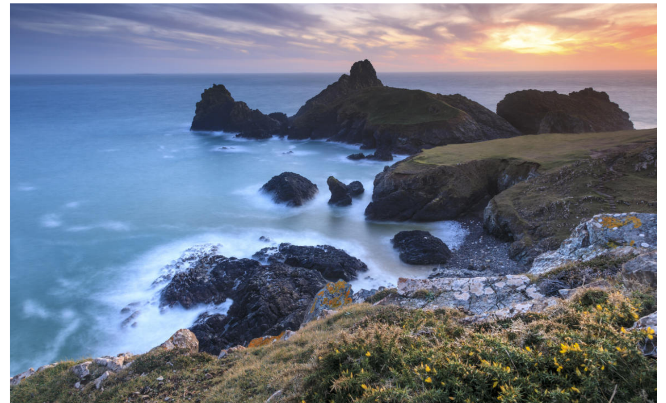
Kynance Cove, Cornwall 83 miles from Plymouth