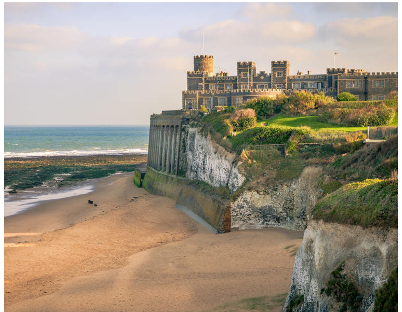
Kingsgate Bay, Kent 80 miles from London