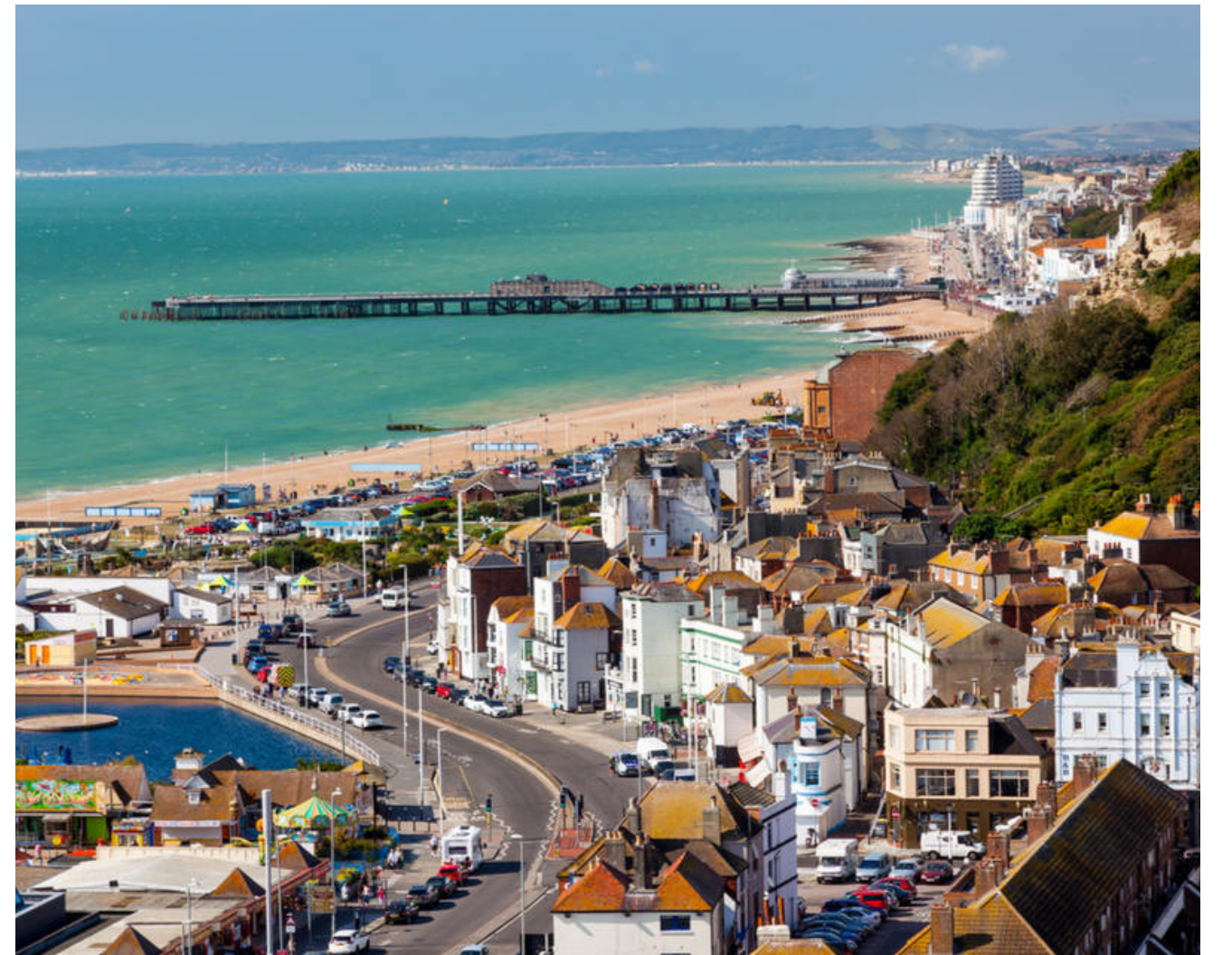
Hastings, East Sussex 37 miles from Brighton