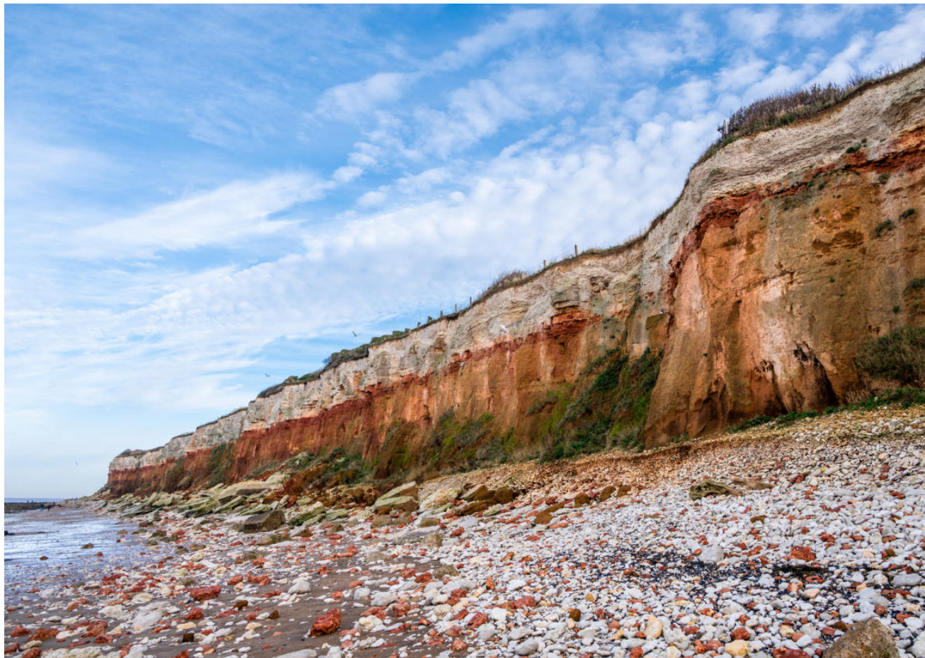
Hunstanton Cliffs, Norfolk 45 miles from Norwich