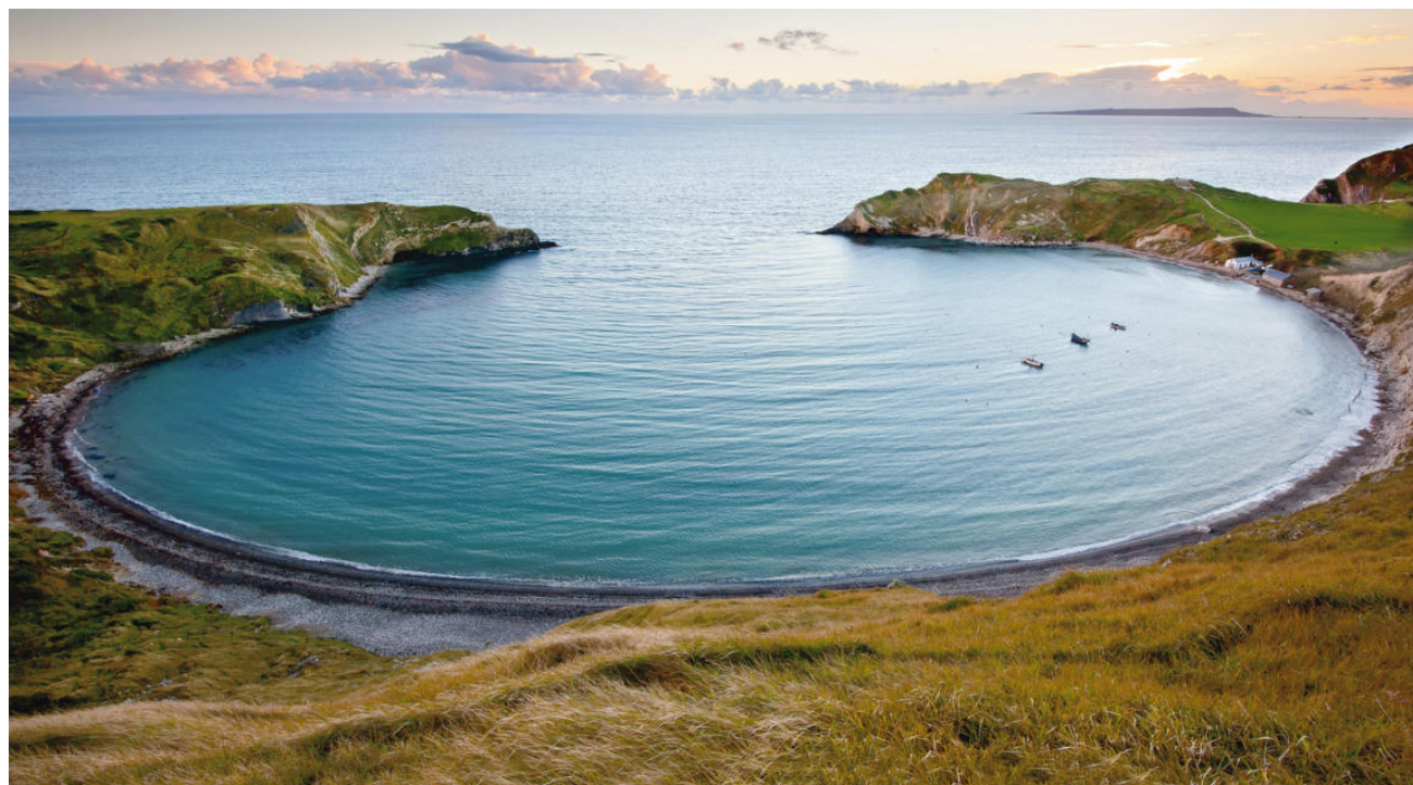
Lulworth Cove, Dorset 74 miles from Bristol