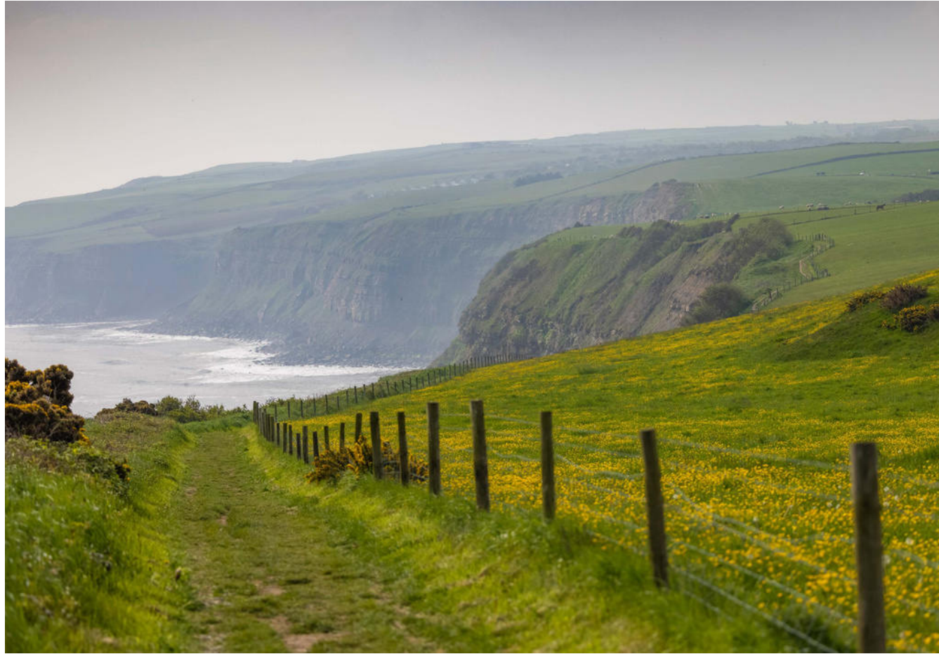
Whitby Coastal Path, North Yorkshire 73 miles from Leeds