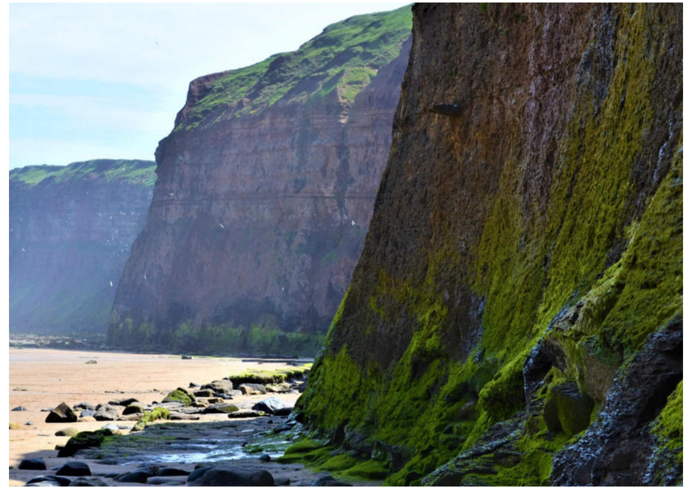
Saltburn by the Sea, North Yorkshire 59 miles from Leeds