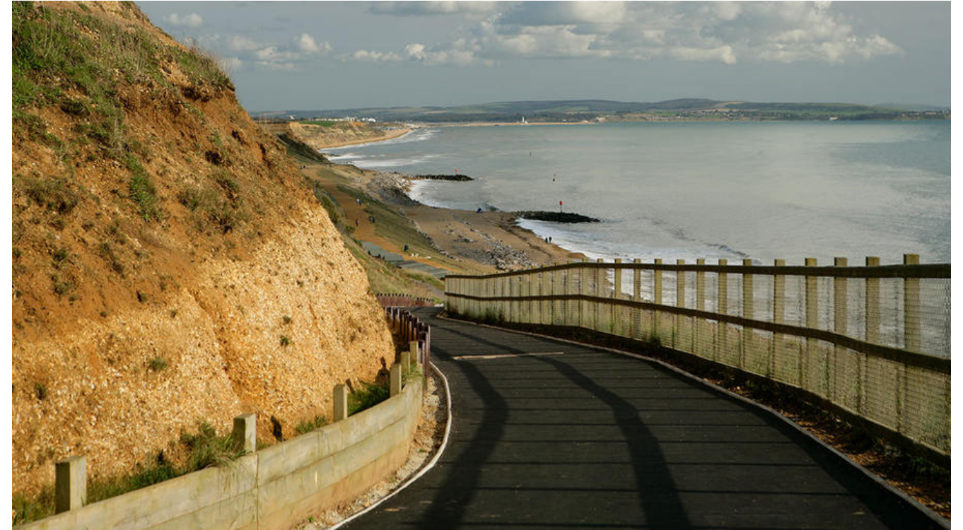
Coastal Road, Hampshire 10 miles from Bournemouth