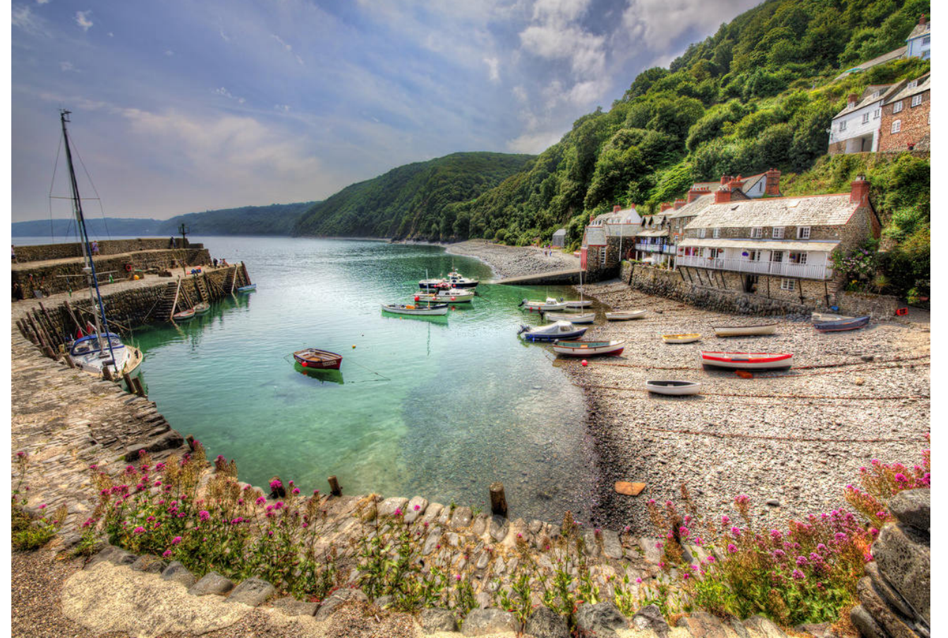
Clovelly, Devon 56 miles from Plymouth