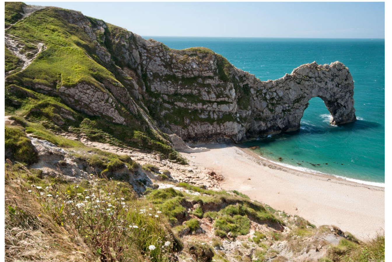
Durdle Door, Dorset 75 miles from Bristol