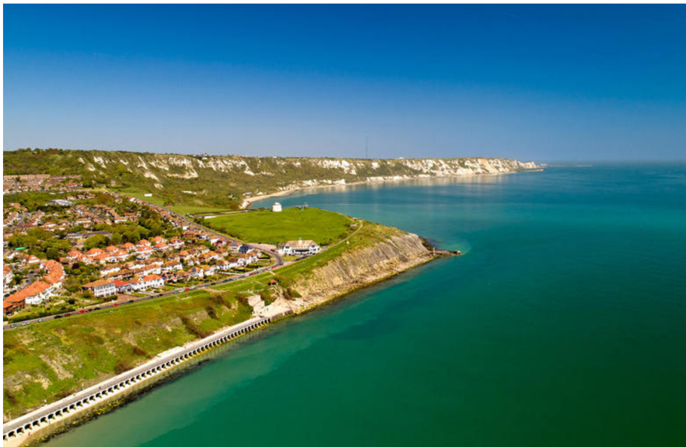
Folkestone, Kent 70 miles from London