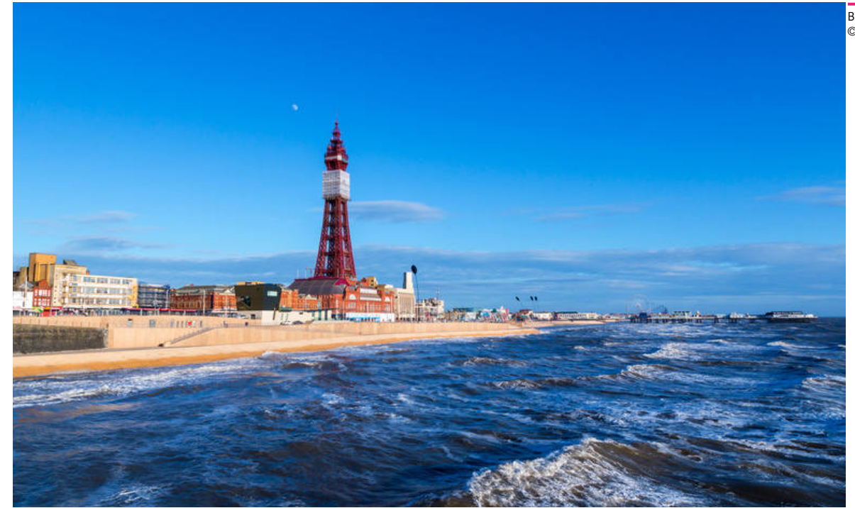
Blackpool, Lancashire