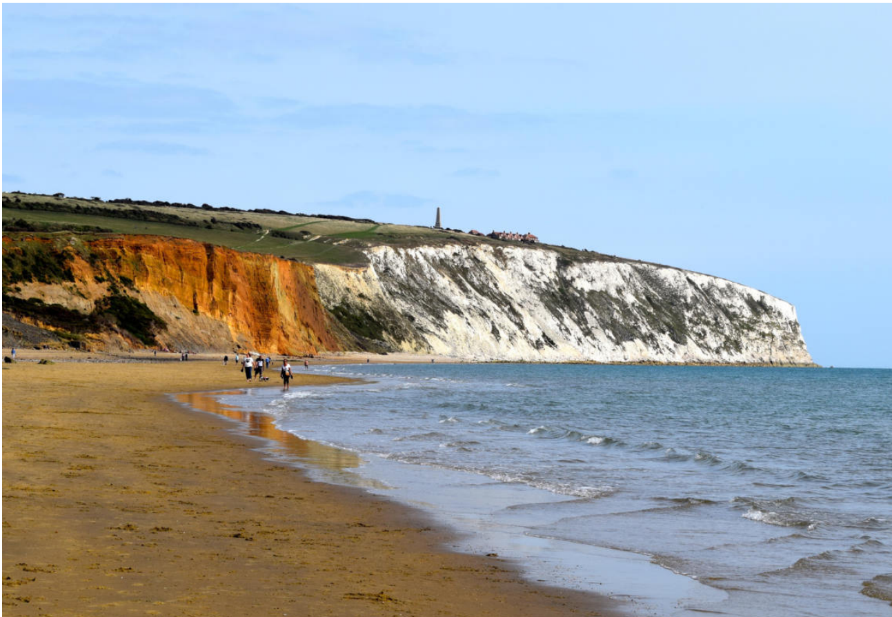
Yaverland Beach, Isle of Wight 41 miles from Bournemouth