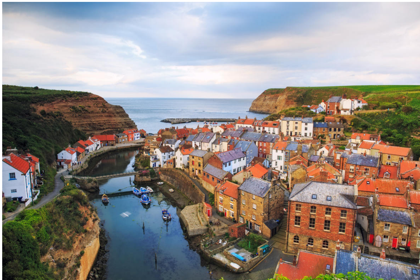
Staithes, North Yorkshire 64 miles from Newcastle