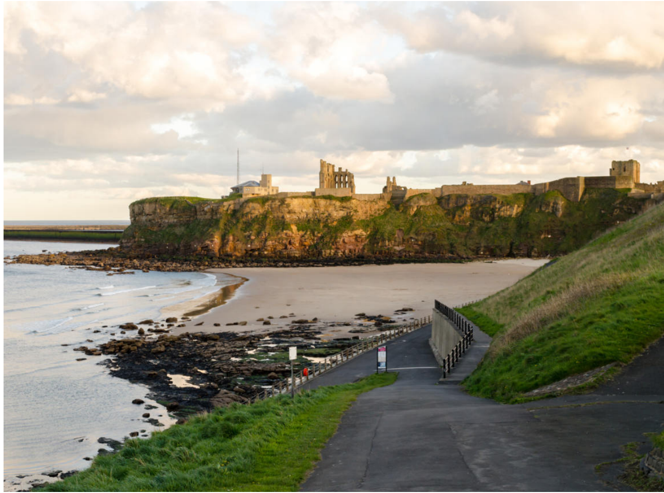
Tynemouth, Newcastle upon Tyne 9 miles from Newcastle