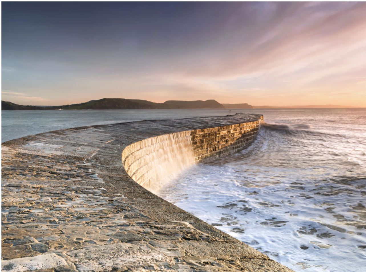
Lyme Regis, Dorset 62 miles from Bristol