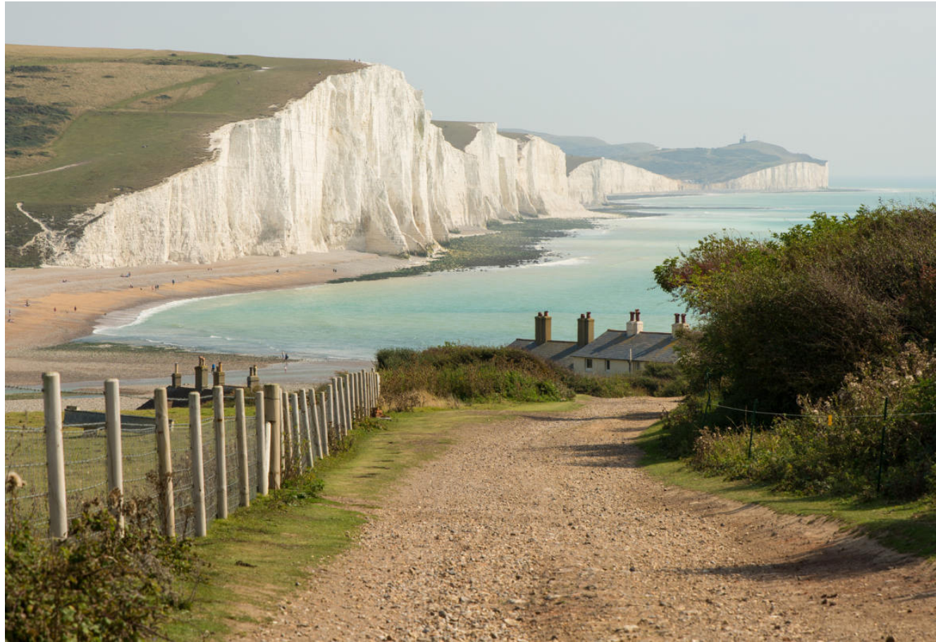
Seven Sisters, East Sussex 19 miles from Brighton