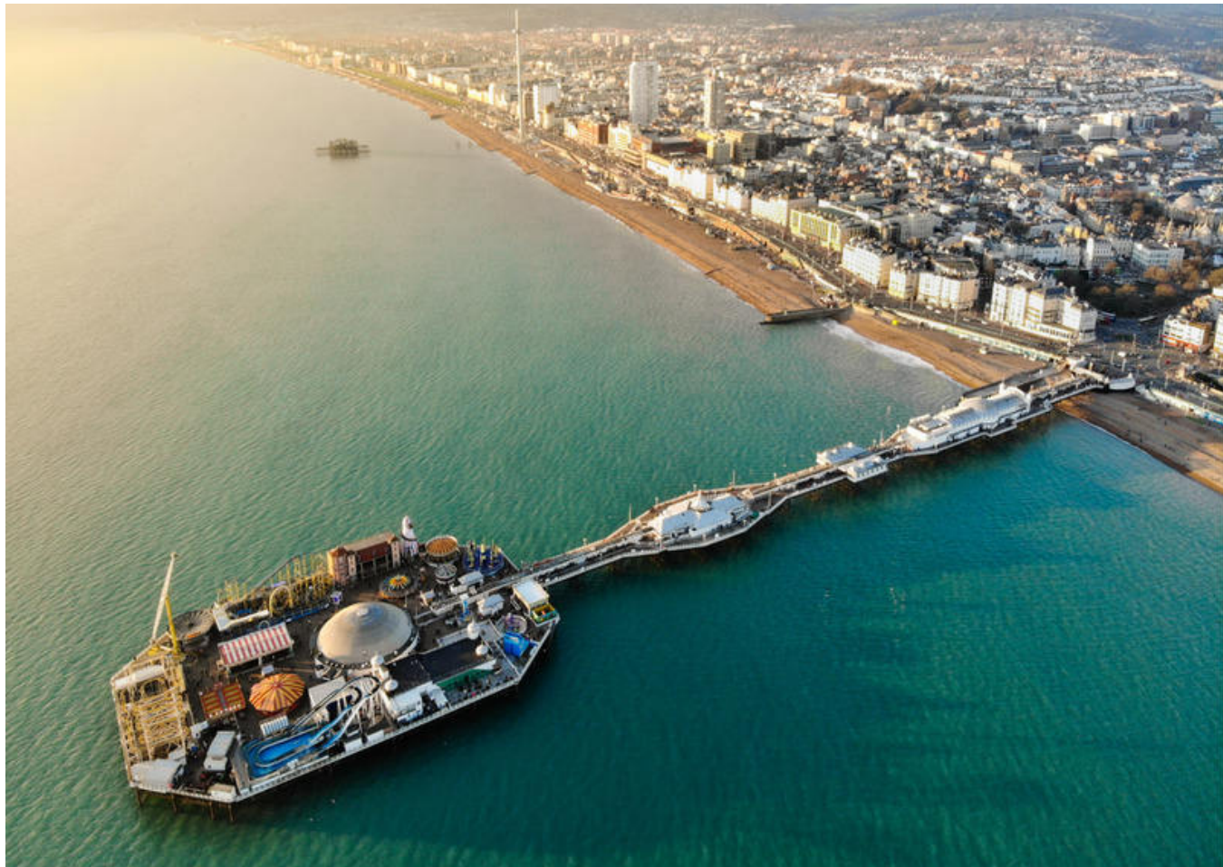
Brighton Pier, East Sussex 53 miles from London