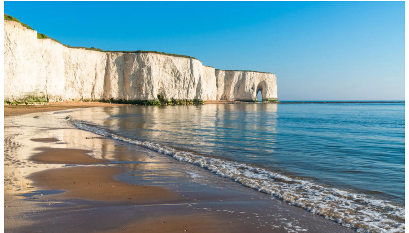
Kingsgate Bay, Kent 80 miles from London