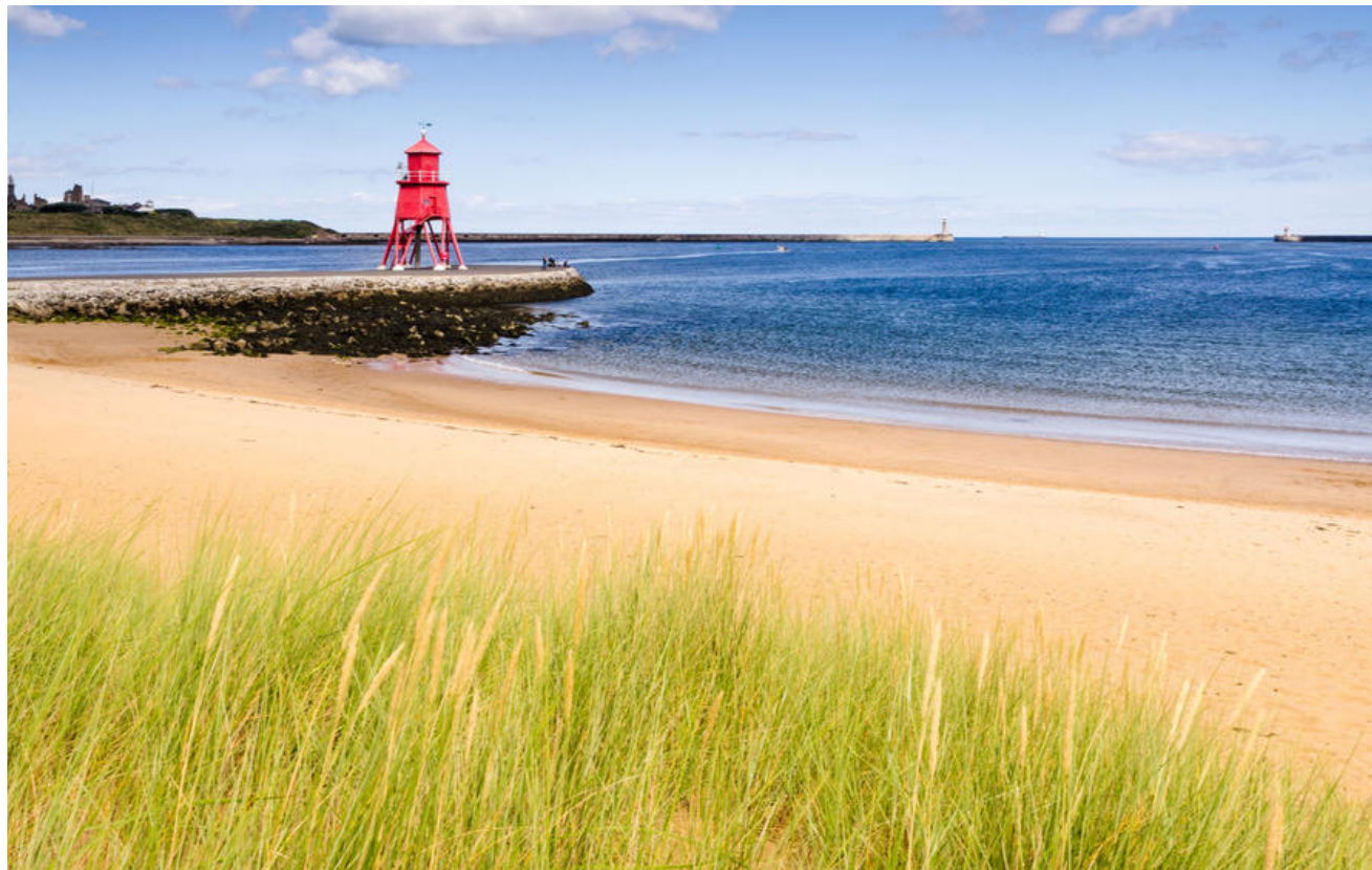
River Tyne, Newcastle upon Tyne 9 miles from Newcastle