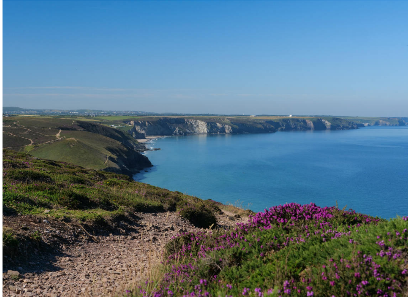
Chapel Porth, Cornwall 60 miles from Plymouth