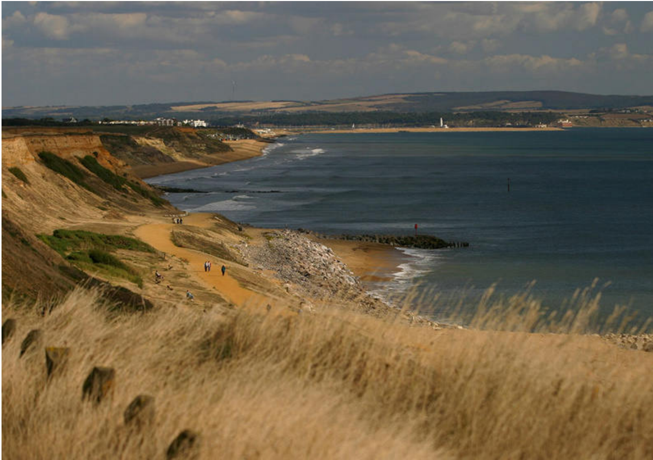
New Forest, Hampshire 10 miles from Bournemouth