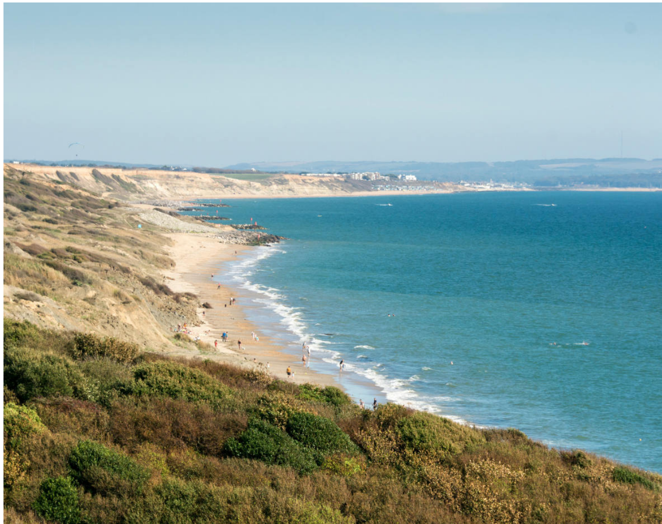
Highcliffe, Hampshire 10 miles from Bournemouth